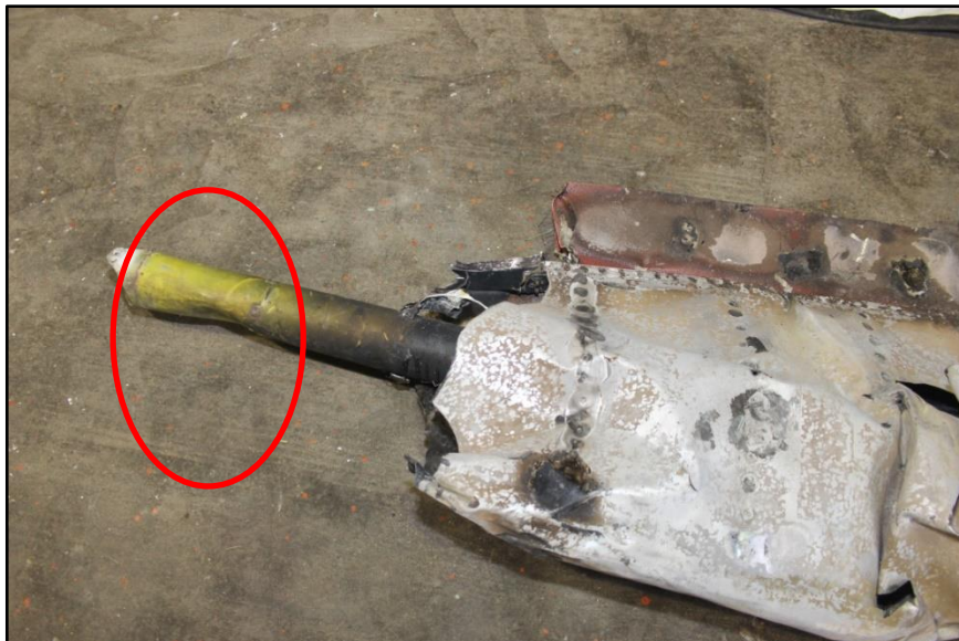
Photo No. 2: Left wing viewed from below with impact mark on main spar

The wing tip separated at this point. As the aircraft travelled onwards it lost the left aileron and then the entire left wing. The remainder of the aircraft then impacted a second boundary hedgerow and tumbled before coming to rest, inverted, in the hedgerow between two fields.