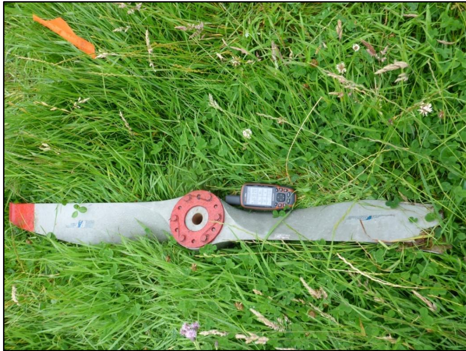
Photo No. 4: Propeller with fractured tip (GPS added by the Investigation)

In addition to seeking to determine the source and origin of the in-flight fire, the Investigation also sought to determine the reason for the loss of elevator authority which the Pilot reported to ATC. During the initial wreckage examination at the accident site, the Investigation confirmed the continuity of the elevator control circuit. The control circuit involves two cables which pass through the engine bay, running through a twin pulley block. The Investigation noted that the pulley block had suffered significant heat damage and that rubberised rollers had been melted away ( Photo No. 5 ).